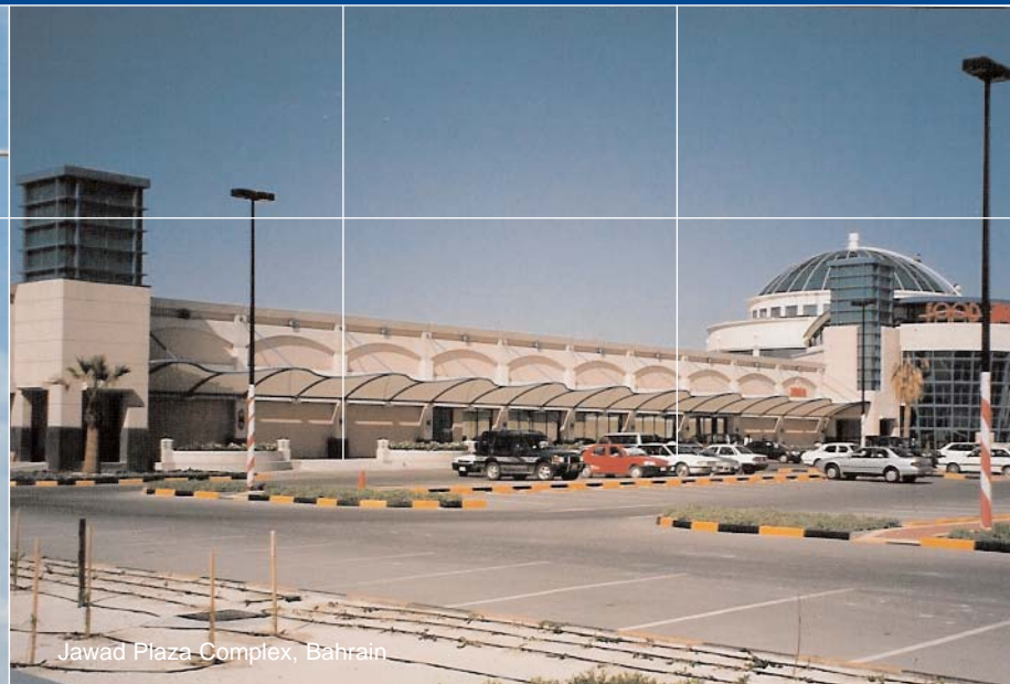
Jawad Plaza Complex, Bahrain