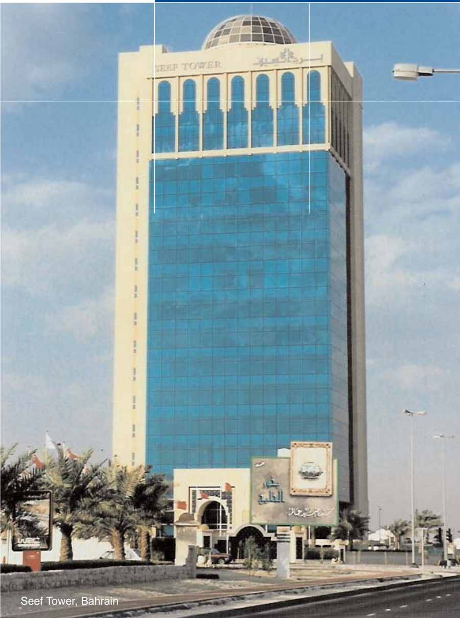
Seef Tower, Bahrain